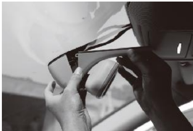
Step 6: Install the main unit, fit with front cover