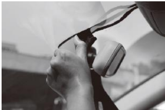
Step 3: Grip both side of front cover with two hands.