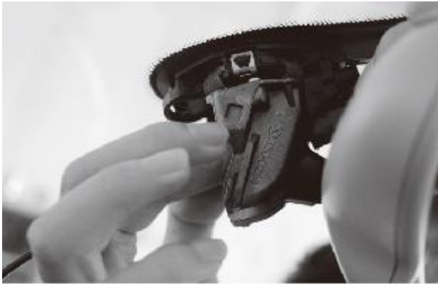
Step 5: Pull out the main wire of the WiFi Dash Camera unit from the mounting hole.