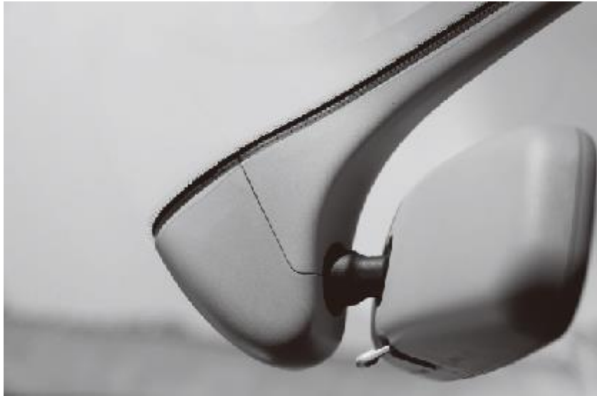
Step 1: Original location before installation