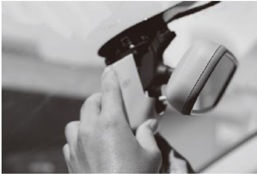
Step 9: Fixed the covering in position, check both side cover after the completion of the fitment.