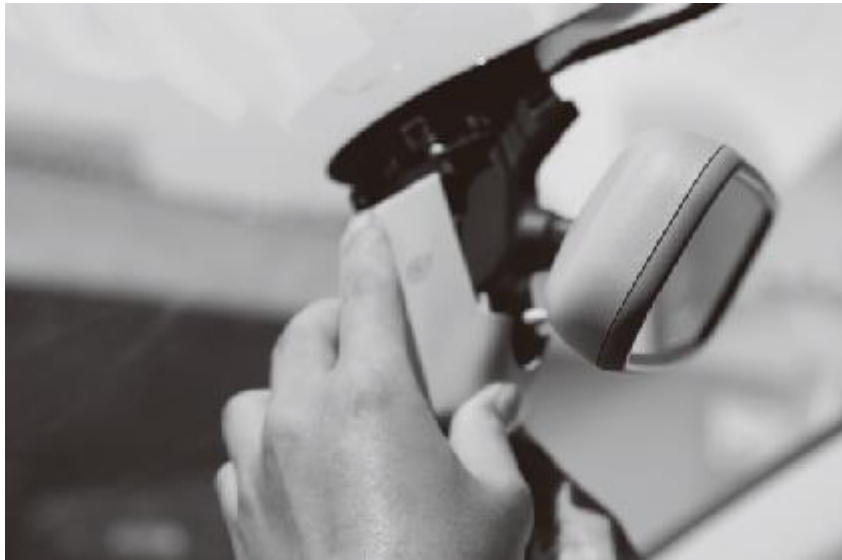
Step 4: Take out the front cover by pulling downwards